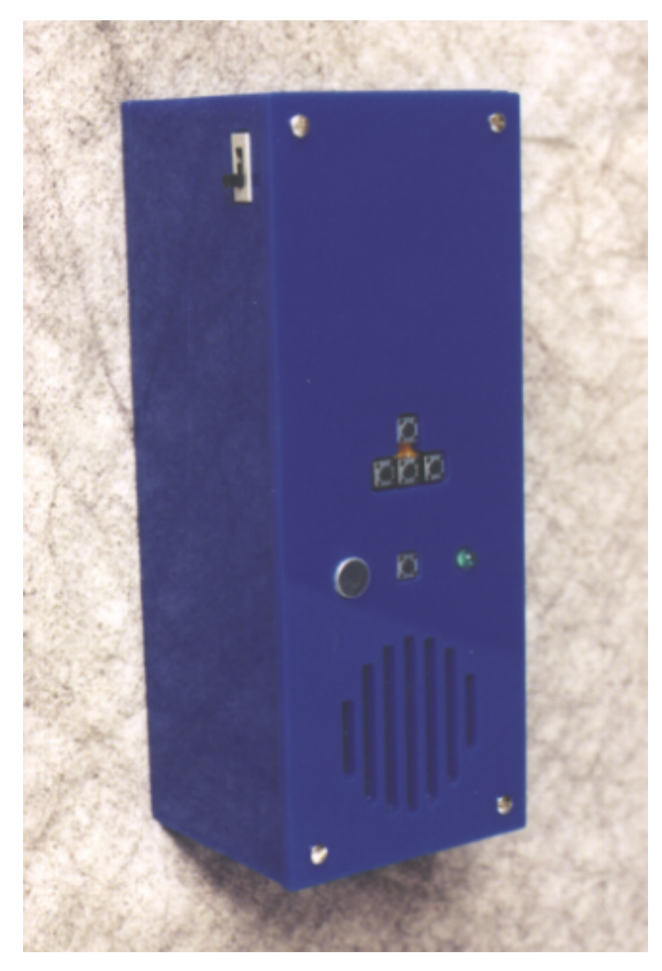
Figure 11.2. Digitally Secured RF Controlled Outlet.