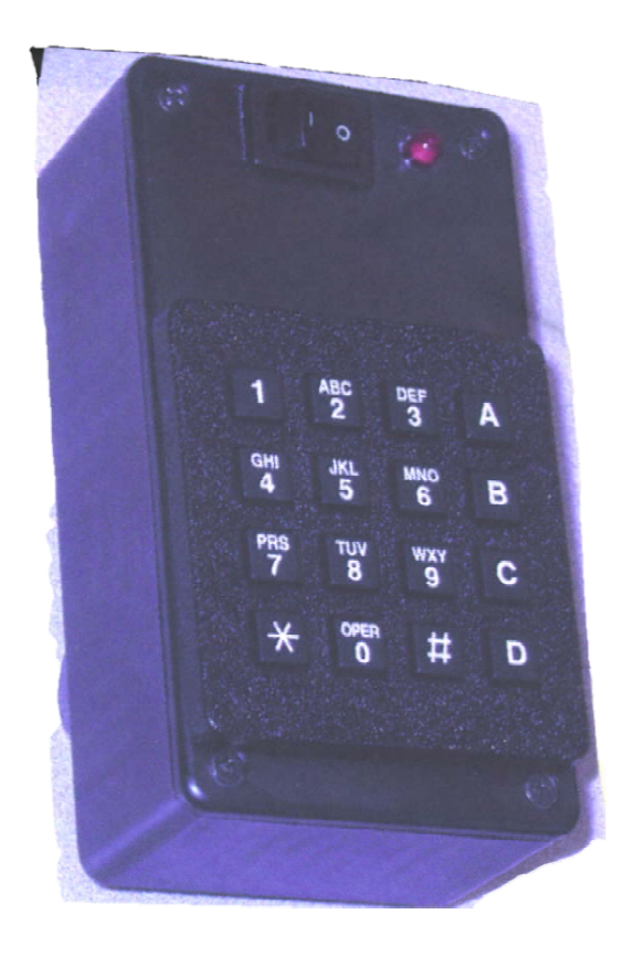
Figure 11.1. Switch Activated Voice Controller.

One feature of the ISD1110 is the capability to play up to 10 seconds of a recording. The 10-second slot can be addressed into 80 segments. Each of these segments is a minimum of 0.125 seconds in length.