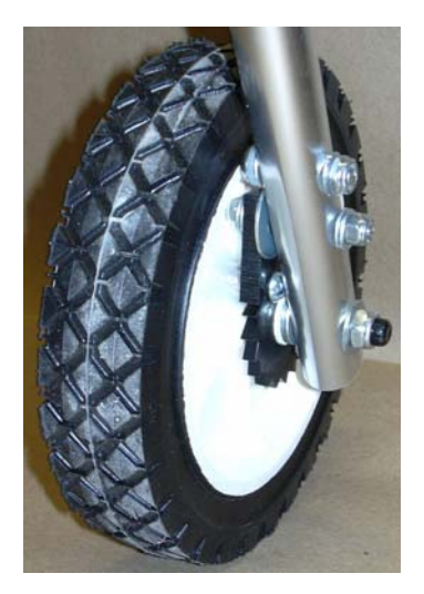
Figure 18.5: Ratchet Mechanism.

The total project cost is $566 for the reverse walker and parts.