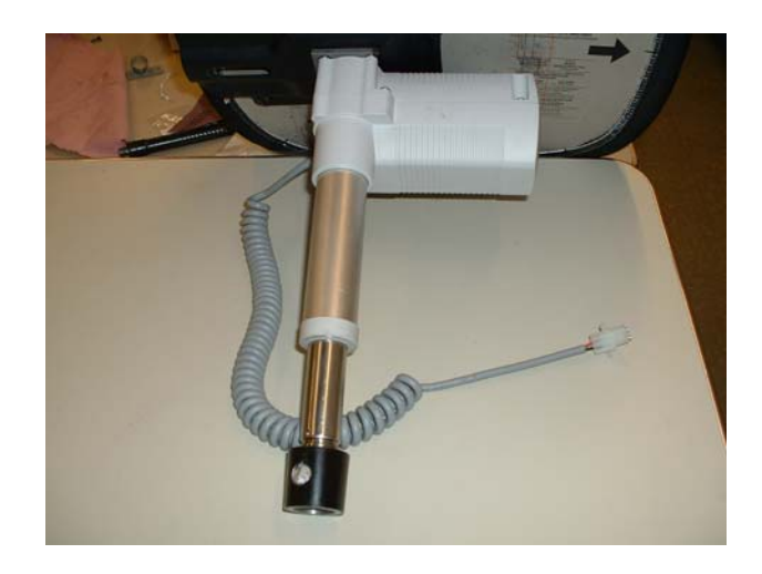
Figure 18.2: Low Noise DC Actuator and Coupling to AS.

Electrical Power and Switch Control: To supply electrical power to the actuator, an 18-volt rechargeable battery was mounted beneath the seat with the necessary electrical circuitry and a switch. The switch has the following characteristics: momentary double throw, double pole, and center neutral. To engage the switch as purchased requires strong effort and dexterity that client does not have. Also, the switch lever arm has limited length