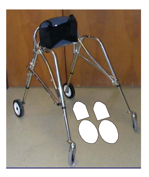
Figure 18.6: Weight-Assist Walker