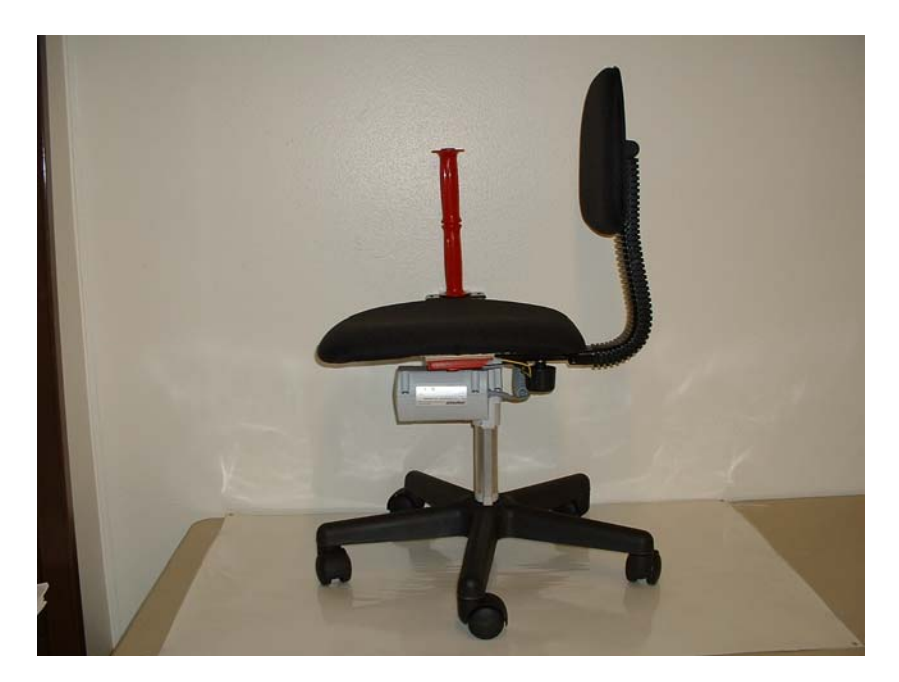
Figure 18.3: Adapted Height-Adjustable Chair.

The total project cost is $277 for the pillar and parts.